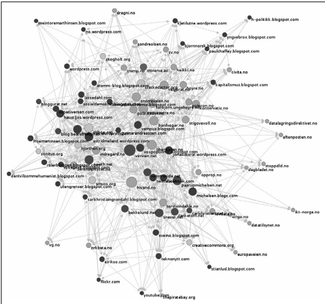
Figure 1. Data Retention Directive network map generated from IssueCrawler by govcom.org at February 4, 2010. Cluster map (size of nodes by in-links and out-links).

the Confederation of Norwegian Enterprise (Paulchaffey). Likewise, the other Socialist Left vice-leader links to the blog of a Conservative Member of Parliament (Konservativ), and several other bloggers on the political right. Importantly, the conservative nodes do not reciprocate these links.